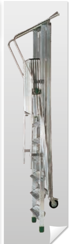
Format for transport