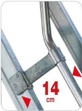
Strong aluminium die casting connection