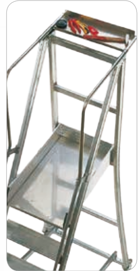
Large and non-slippery sheet aluminium platform (48x77 cm). It's fitted with big tool tray