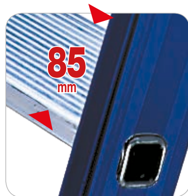
85 mm non-slip aluminium treads