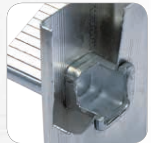
Stile/tread connection through triple expansion and crimping