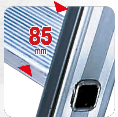
85 mm non-slip treads