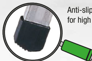
Anti-slip high shoes for high safety