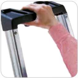
Large tool tray