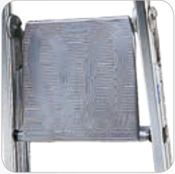
Aluminium die casting platform