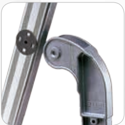
Aluminium die casting hinge with polyamide clutch insert to avoid the material wear and tear