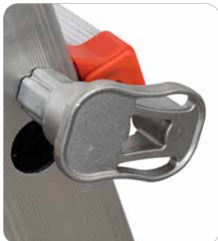
Rung locking pin, made from aluminium die casting and stainless steel DESIGN FACAL