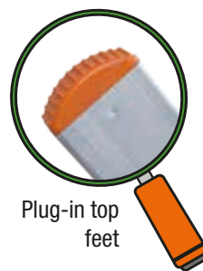
Plug-in top feet