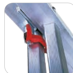
Anti unthreading stops