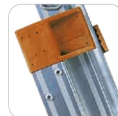
Steel sliding devices coated with nylon