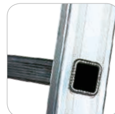
30x30 mm square non-slip rung, with 68° slope