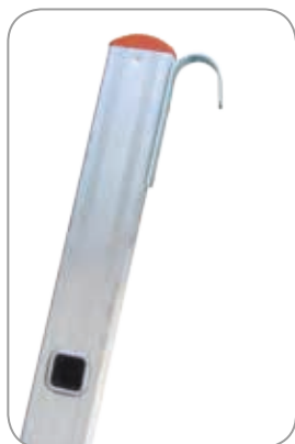
ACCESSORY: Steel hooks