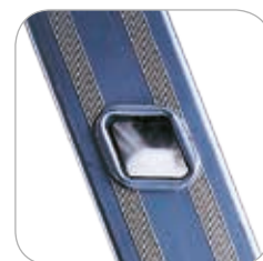
30x30 rhomboidal non-slip rungs with 68° slope