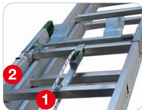
Steel locking fall hook mechanism 1 Main rope 2 Secondary rope to recall the locking fall hook