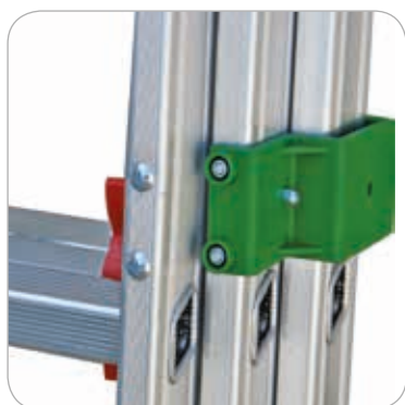
Steel sliding devices coated with nylon