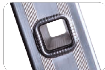
30x30 mm square non-slip rungs