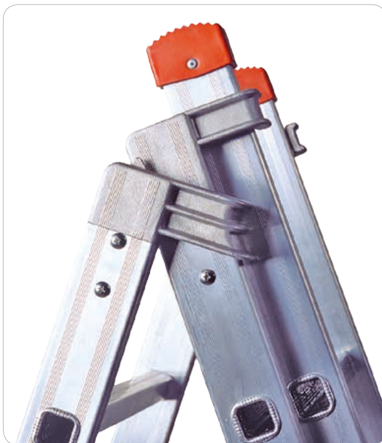
Strong aluminium die casting hinges, fixed with screws to the stiles. Easy to use both in A-frame step and as leaning ladder.