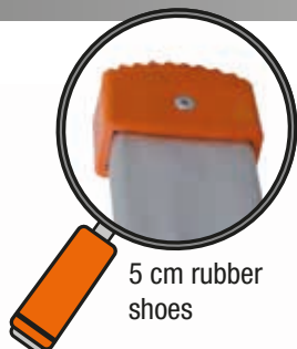
5 cm rubber shoes