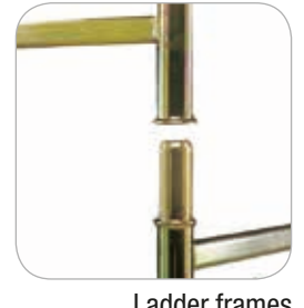
Ladder frames connection