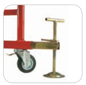
ACCESSORY not included: leveller