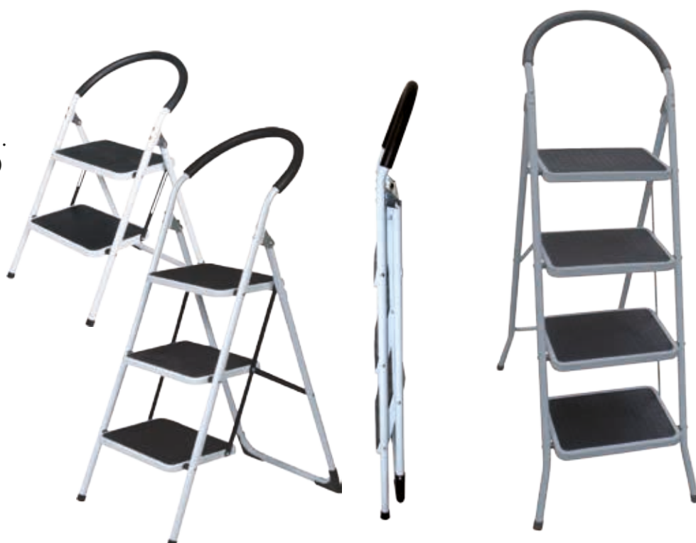
TONTO-4: only grey