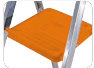
Steel painted platform