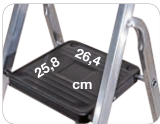
Steel painted platform