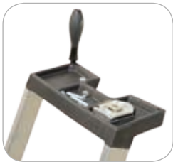
Integrated tool tray and hook