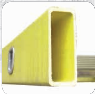
Pultrusion composed by fibreglass and resin stratified tissues