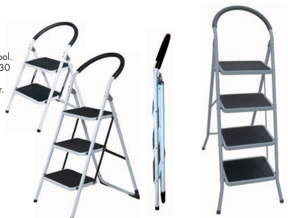
TONTO-4: only grey