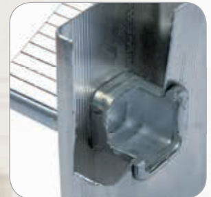
Stile/tread connection through triple expansion and crimping