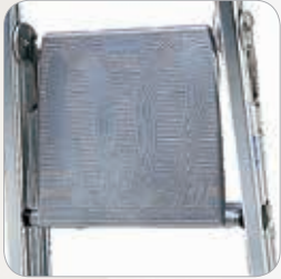
Aluminium die casting platform