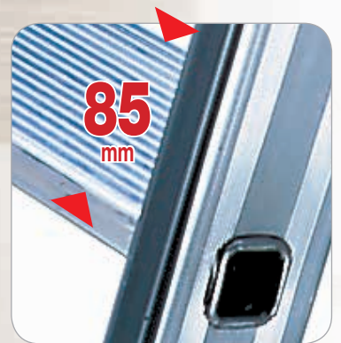
85 mm non-slip treads