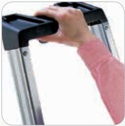
Large tool tray