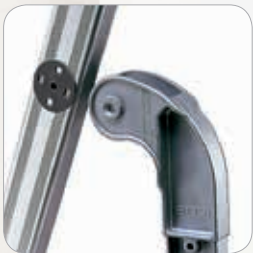
Aluminium die casting hinge with polyamide clutch insert to avoid the material wear and tear