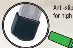
Anti-slip high shoes for high safety