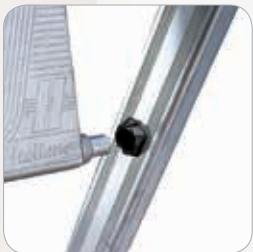
Nylon brasses, for the platform rotation