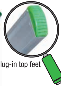
plug-in top feet