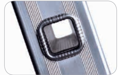
30x30 mm square non-slip rungs