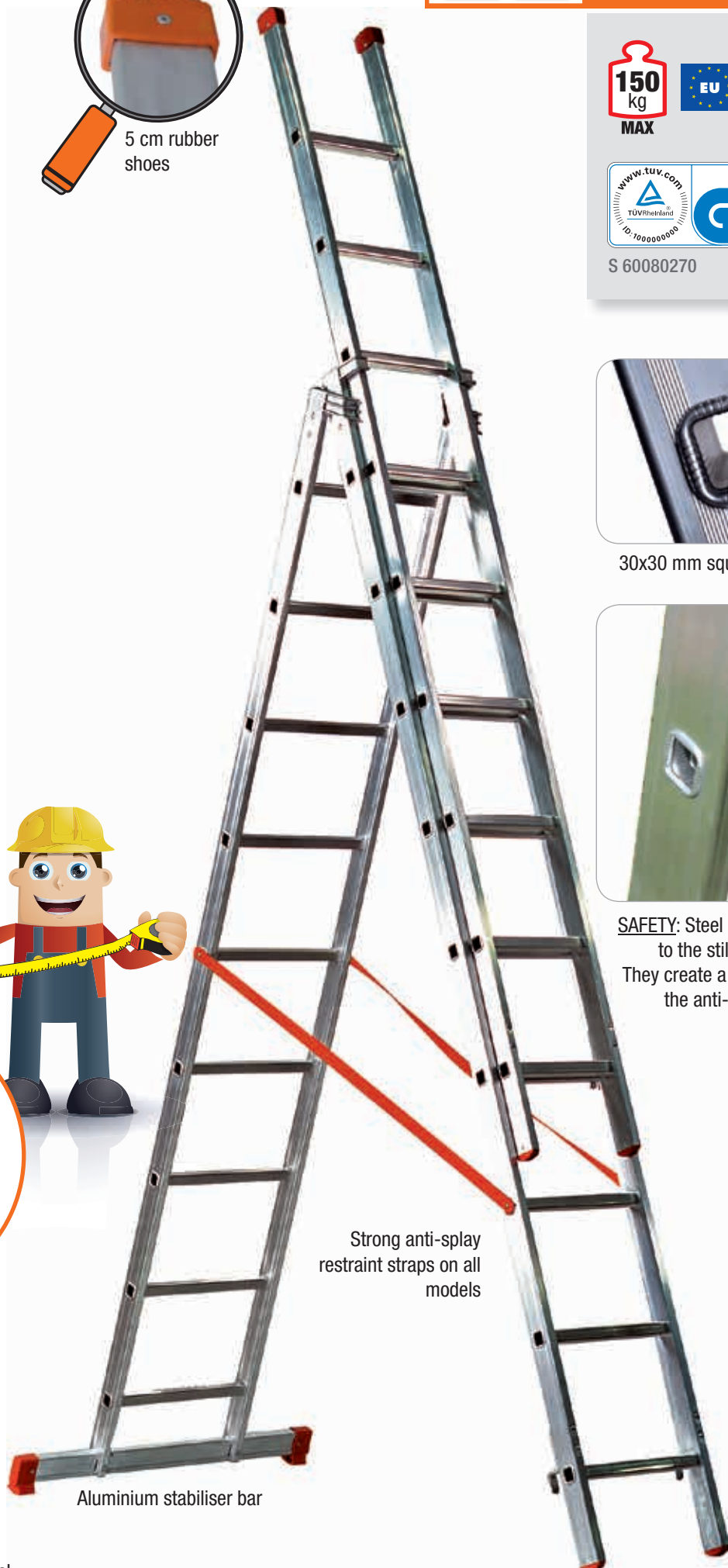
Aluminium stabiliser bar