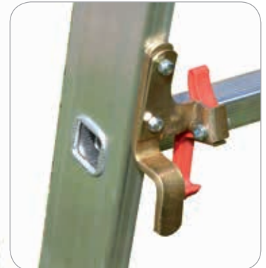
SAFETY: Steel safety hooks fixed to the stiles with stay bolts. They create a unique piece with the anti-unthreading stops