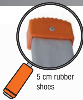
5 cm rubber shoes