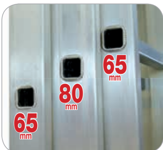
Diversified stiles sizes on the model G300-3