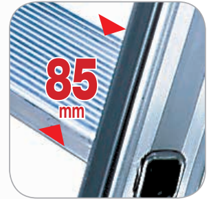
85 mm non-slip aluminium treads