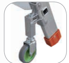
80 mm Ø turning and self-blocking front castors