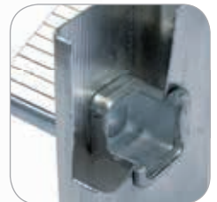
Stile/tread connection through triple expansion and crimping