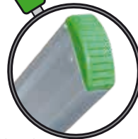
Plug-in top feet.