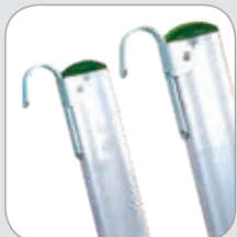
Steel hooks Code: FE-119/A