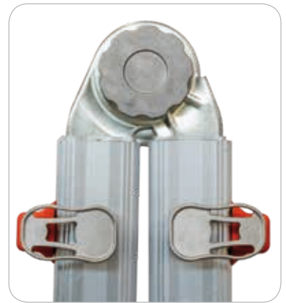
Steel automatic hinge

Four splits on the stiles and four removable feet fixed through the non-metal plugs. Two splits on the same side hold the rapid widening system.