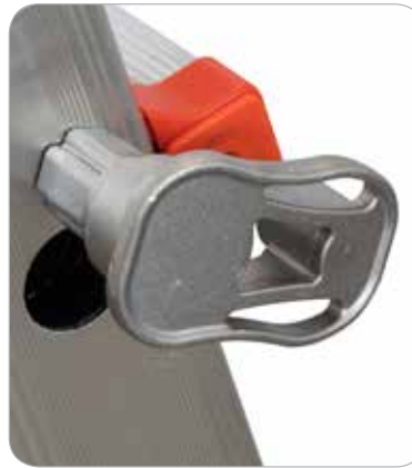
Rung locking pin, made from aluminium die casting and stainless steel DESIGN FACAL